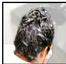
Correct application of Ulesfia Lotion

If not enough Ulesfia Lotion is used, some lice may escape treatment. It is important to use the full amount of Ulesfia Lotion prescribed by your doctor.